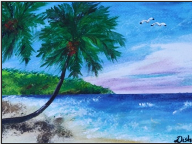
Disha , 16M069, MBBS